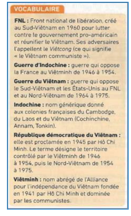
Fig. 1: Vocabulary

The fourth document is the survey on American public opinion about "whether the landing of US troops in Vietnam is a mistake".